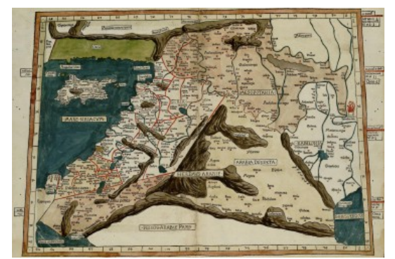
THE HOLY LAND: ESPRESSIVE LANDFORMS