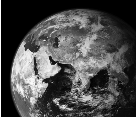
SATELLITE VIEW, NASA: EASTERN HEMISPHERE