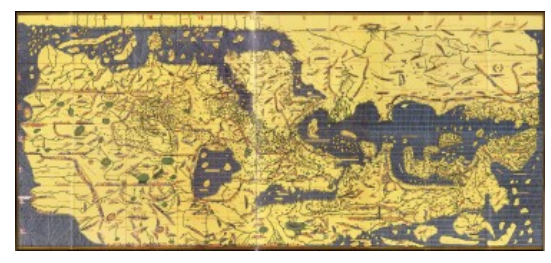
AL IDRISI, TABULA ROGERIANA, 1154. THE SOUTH IS UP THE MIDDLE EAST IN THE MIDDLE OF THE OLD WORLD