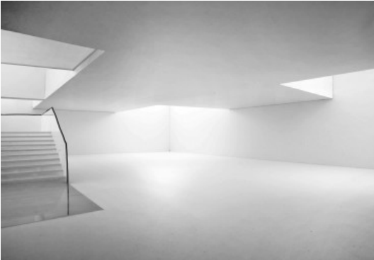
PROJECT BY TOBIAS TOMMILA: INTERIOR VIEW.

The quality of Tobias Tommila's project is the focus on the expression and identity of a cinema. The program of the "Cineteca Svizzera" is a heterogeneous mix of functions with two cinema-halls which are not more than dark and closed rooms. Nevertheless the expressive shape of the roof which is becoming apart also in the interior is able to formulate the identity of a particular building. Even the relation of the iconic appearance in contrast to the historic city offers a dialogue, because the permanent and archaic materialization with a rough texture concrete façade and roof corresponds to the typical buildings where the skin is completely of stone.