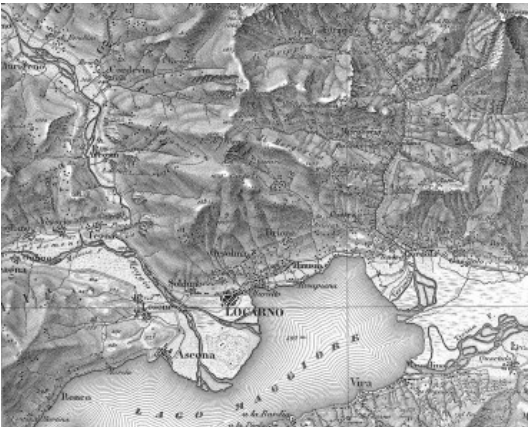
MAP, DUFOURKARTE 1858.