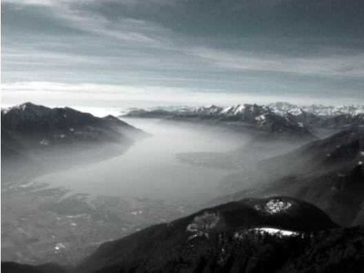
OVERVIEW OF LOCARNO WITH THE LAGO MAGGIORE.