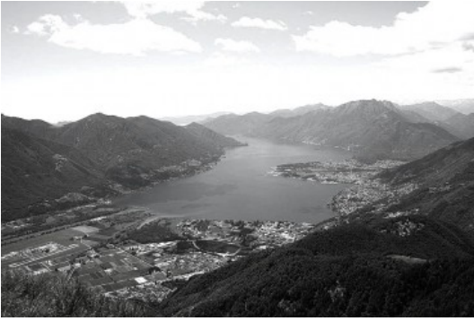
OVERVIEW OF LOCARNO WITH THE LAGO MAGGIORE.