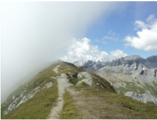
?BANNER CLOUD? ON THE FIL DE CASSONS, GRISONS