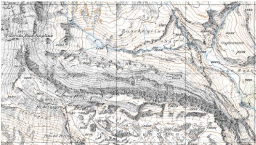
FIL DE CASSONS NEAR FLIMS