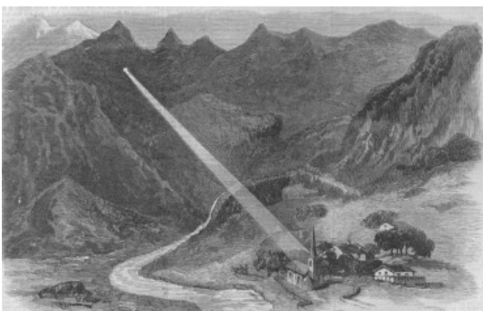
A SUN-RAY FROM THE MARTINSLOCH HITTING THE CHURCH OF ELM

The Fil de Cassons is a mountain range 2700 metres above sea level in Grisons, Switzerland.