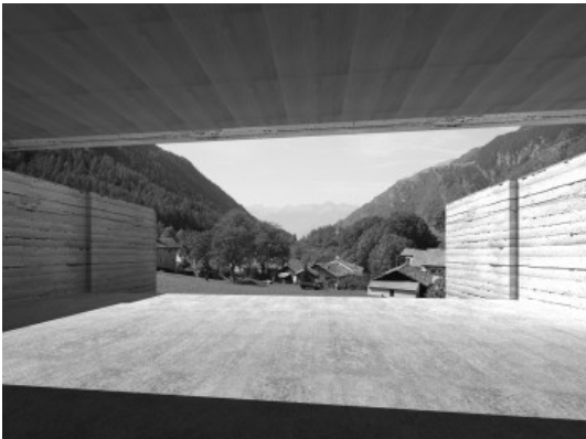
PROJECT BY XIONG SUN: VIEW TO THE WEST.