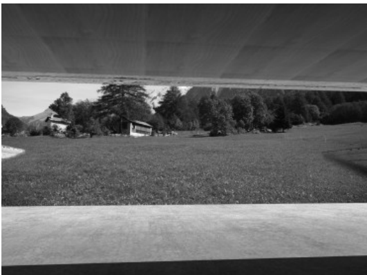
PROJECT BY XIONG SUN: VIEW TO THE EAST.

From the viewpoint of adaptation Xiong Sun's project demonstrates that architecture does not solely operate within its immediate surroundings - the ever present contextual influences and bioclimatic factors - but can also provoke the engagement of a larger landscape, in this particular case the whole Val Bregaglia.