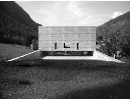
PROJECT BY XIONG SUN: VIEW TOWARDS THE VALLEY.