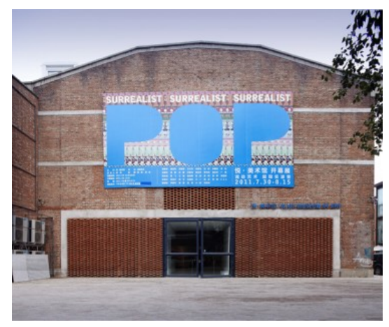
YUE ART GALLERY