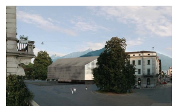
PROJECT BY TILL THOMSCHKE: EXTERIOR VIEW.